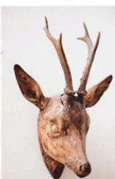
Chaque espèce, le mannequin se laisse guider par son instinct sans chercher à rencontrer ni à expertiser ses frustes. « J'ai une bouteille la fin de « une petite fille de cet en bois, trouvée aux puces de Chelsea ».