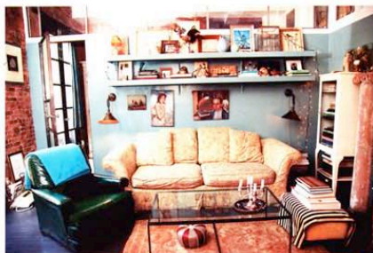
Le loft d'Helena Christensen (à droite, à droite, suite par Herb Ritts dans le clip Wicked Game de Chris Isaak) incarne l'élégance - déjantée - qui a toujours symbolisé le West Village à Manhattan. Intellectuel et artiste contemporain d'appuyer le charme des rues parées, des « bohemians » des fleuristes raffinés et des restaurants pour gourmets. La mannequin d'hiver et le quartier il y a un an, pour un événement « caritatif ».